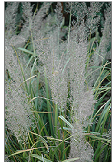
Korean Reed Grass fruit