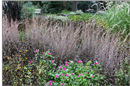
Standing Ovation Bluestem in fall

This is a relatively low maintenance plant, and is best cut back to the ground in late winter before active growth resumes. It has no significant negative characteristics.