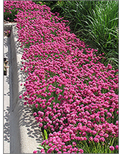
Dusseldorf Pride Sea Thrift in bloom