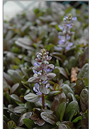
Chocolate Chip Bugleweed flowers

Chocolate Chip Bugleweed is recommended for the following landscape applications;