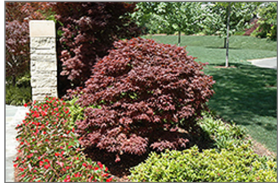
Rhode Island Red Japanese Maple

Rhode Island Red Japanese Maple is recommended for the following landscape applications;