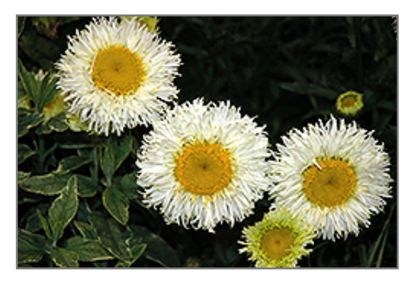
Realflor Real Galaxy Shasta Daisy flowers

Brockville 3043 County Rd. 29 Brockville, Ontario, Canada K6V 5T4 Telephone: +1 613 341 9343