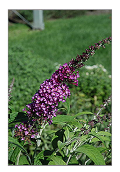
Buzz Pink Purple Butterfly Bush flowers

Brockville 3043 County Rd. 29 Brockville, Ontario, Canada K6V 5T4 Telephone: +1 613 341 9343