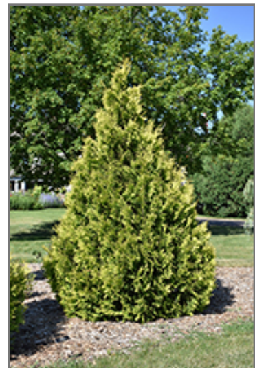
Yellow Ribbon Arborvitae

Ottawa West 2079 Carp Road Ottawa, Ontario, Canada K2S 1B9 Telephone: +1 613 836 6880