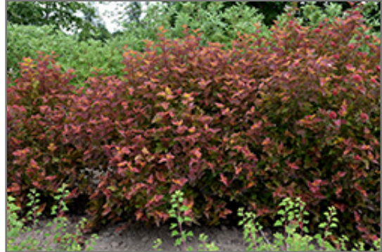
Amber Jubilee Ninebark

This shrub does best in full sun to partial shade. It is very adaptable to both dry and moist locations, and should do just fine under average home landscape conditions. It is not particular as to soil type or pH. It is highly tolerant of urban pollution and will even thrive in inner city environments. This is a selection of a native North American species.