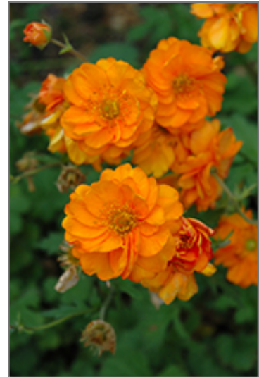
Fire Storm Avens flowers

This is a relatively low maintenance plant, and should be cut back in late fall in preparation for winter. It is a good choice for attracting butterflies to your yard, but is not particularly attractive to deer who tend to leave it alone in favor of tastier treats. It has no significant negative characteristics.