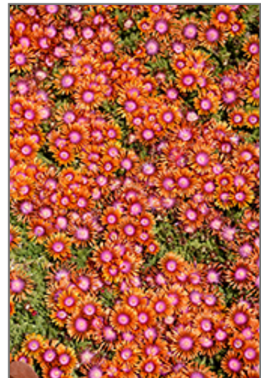
Fire Spinner Ice Plant flowers