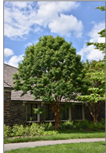
Paperbark Maple