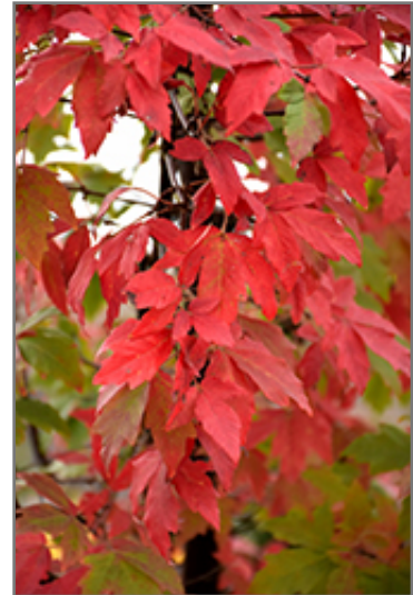
Paperbark Maple in fall

This tree does best in full sun to partial shade. It prefers to grow in average to moist conditions, and shouldn't be allowed to dry out. It is not particular as to soil type or pH. It is somewhat tolerant of urban pollution. This species is not originally from North America.